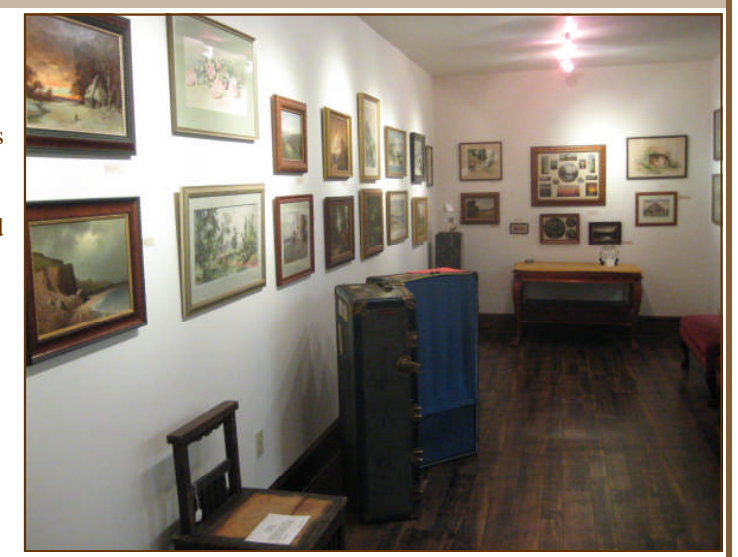
Rose M. Shave Gallery

1997 and on framing the water colors in 1998.