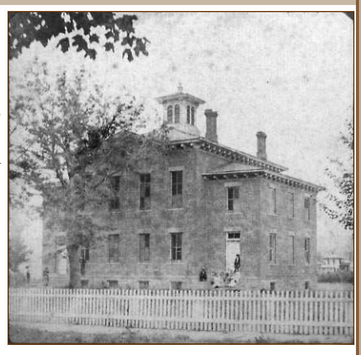
The Nunda Third Academy built in 1867 on the current KCS school grounds.